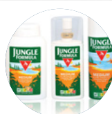
JUNGLE FORMULA MEDIUM 125ml £8.15, www.feelunique.com