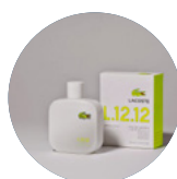
LACOSTE L.12.12 'NEON' SPECIAL EDITION 100ml £47, Boots nationwide