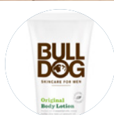
BULLDOG ORIGINAL BODY LOTION 200ML £4.49, at Sainsbury's nationwide