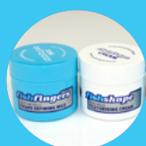
FISH HAIR PRODUCT 'MINIS' £2.99, Boots nationwide