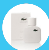
LACOSTE L.12.12 30ml MINIS £29, www.debenhams.com