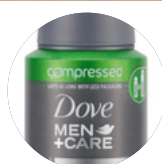
DOVE MEN + CARE SILVER CONTROL SPRAY 75ml £2.79, www.boots.com