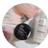
THE BODY SHOP MINI SKINCARE KIT £14, www.thebodyshop.co.uk