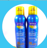
NIVEA PROTECT & REPLENISH COOLING MIST 200ml £16, Boots nationwide