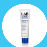
LAB SERIES BB CREAM 50ml £35, www.labseries.co.uk